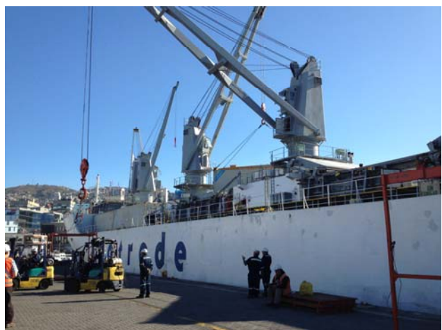
OR in interesting places: this is the port of Valparaiso in Chile. A vessel is being loaded with fresh fruit, bound for the USA.

Nominations will be accepted at any time up to the time that voting for the committee commences during the AGM on 17 April. Please consider throwing your hat into the ring for the ASOR Melbourne Chapter committee!